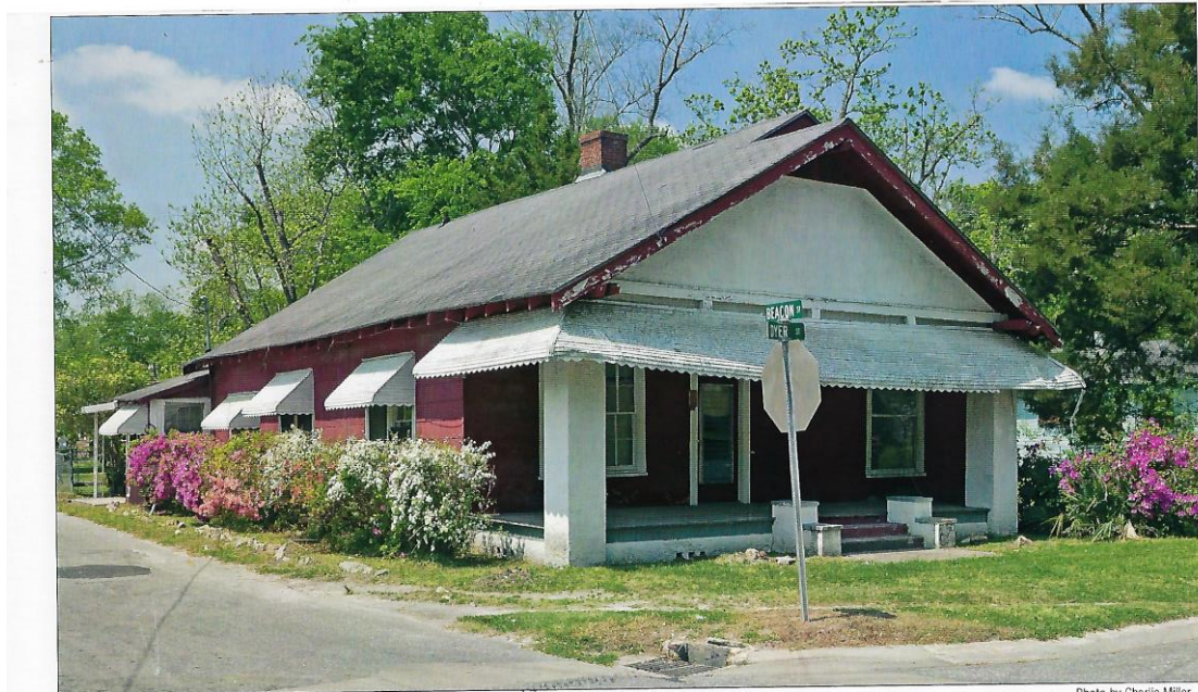
HISTORIC GEORGIA B WILLIAMS NURSING HOME