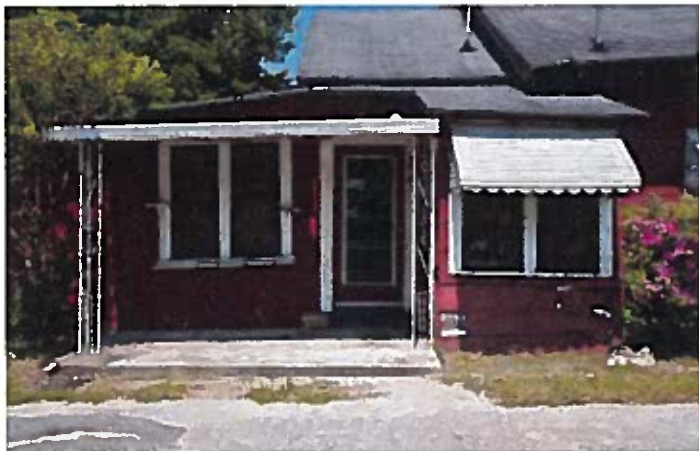
The entrance for mothers was located on a side street near the rear of the house.

room, recovery rooms, nursery, small office, laundry room, and side lobby entrance for expectant mothers. These medical rooms are in the rear of the house. The front rooms include the owner's living room, bedroom, and dining room. A kitchen and breakfast room, plus one full bath (shared by all) and two half baths, are also located in the back section of the house.