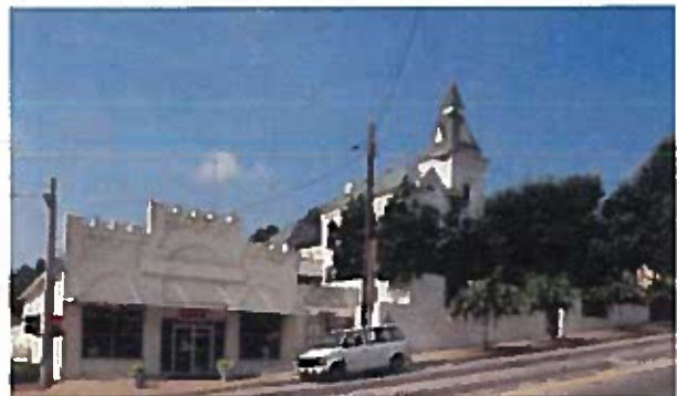
Today, the former Troup County Jail houses the Chattahoochee Valley Art Museum in the LaGrange Commercial Historic District.