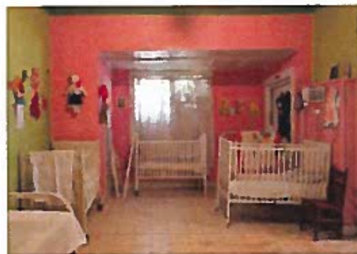
This was once a recovery room, and infant cribs were located in a separate nursery.

The nursing home was licensed by the state. Midwives who worked in Georgia were required to take a test given by the Georgia Health Department at the public health clinic in Camilla. Women had to be declared healthy enough by the white doctors in Camilla in order to have a baby delivered by midwife. These certifications, called "green cards," would only be signed by the doctor after the seventh month of pregnancy.