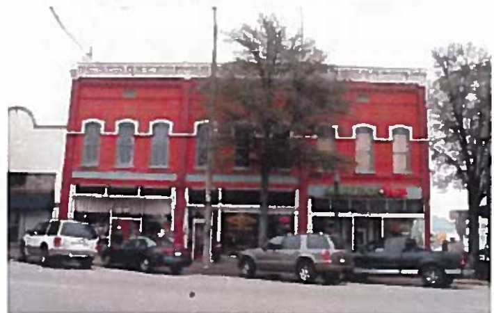
The Loyd Building is an Italianate Style retail structure that is located within the LaGrange Commercial Historic District.