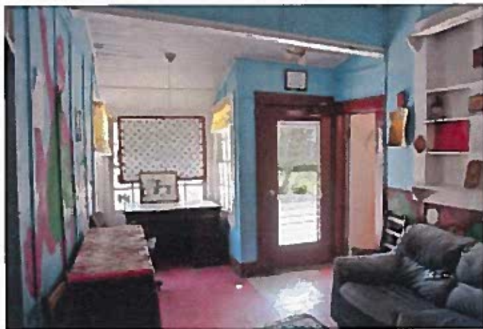
The house interior was separated into private and public spaces, although some areas were also shared. This is the lobby (parlor) in the rear section where patients entered from a side door.